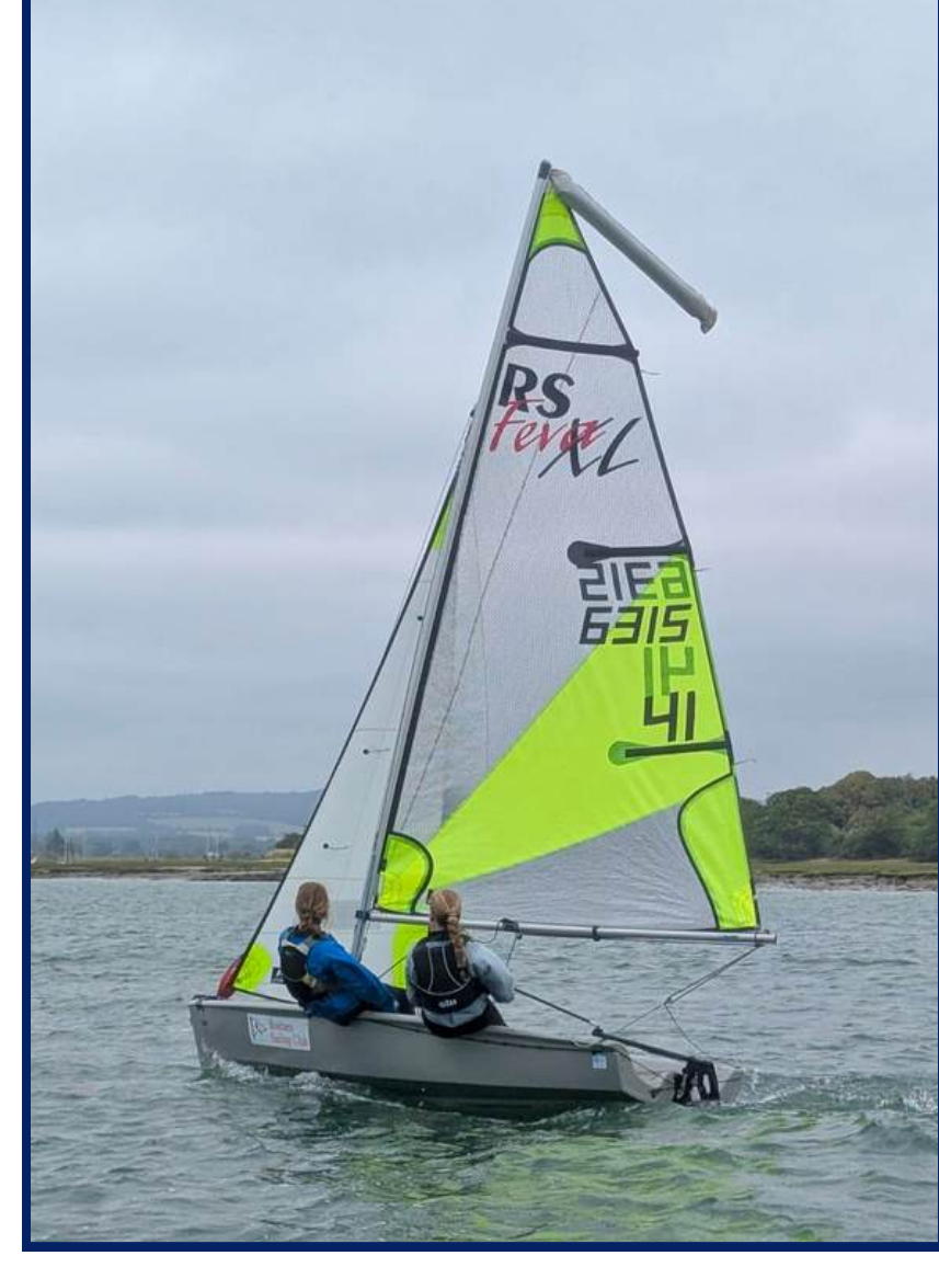
Respect, Happiness, Achievement